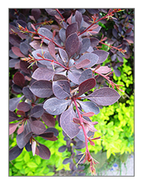
Red Leaf Japanese Barberry foliage

Del Rey Oaks 899 Rosita Rd Del Rey Oaks, CA 93940 831-920-1231