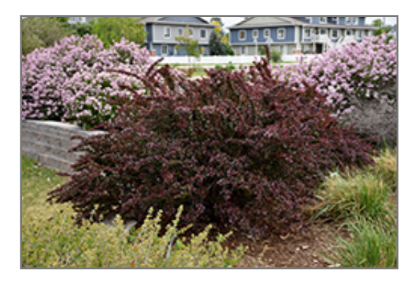
Red Leaf Japanese Barberry

This is a relatively low maintenance shrub, and can be pruned at anytime. Deer don't particularly care for this plant and will usually leave it alone in favor of tastier treats. Gardeners should be aware of the following characteristic(s) that may warrant special consideration;