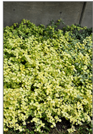
Lemon Licorice Plant