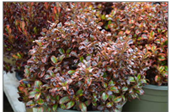
Tequila Sunrise Mirror Bush