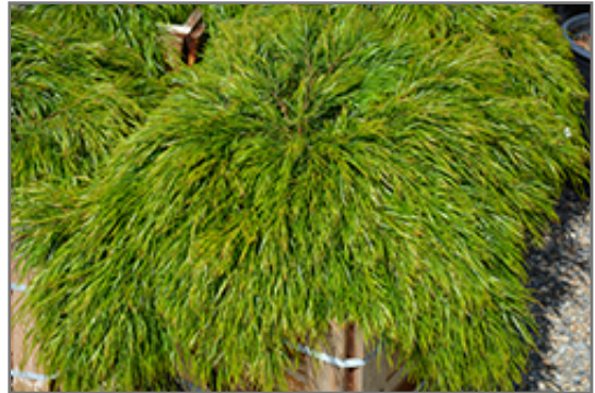
Cousin Itt Little River Wattle

Cousin Itt Little River Wattle is recommended for the following landscape applications;