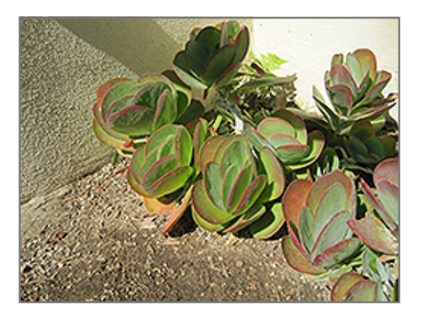
Flapjacks Kalanchoe

Seaside 1177 San Pablo Ave Seaside, CA 93955 831-393-0400