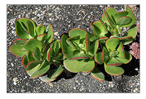
Flapjacks Kalanchoe foliage

Flapjacks Kalanchoe is recommended for the following landscape applications;