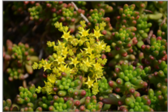
Jelly Bean Plant flowers

Jelly Bean Plant will grow to be only 5 inches tall at maturity, with a spread of 14 inches. When grown in masses or used as a bedding plant, individual plants should be spaced approximately 10 inches apart. Its foliage tends to remain low and dense right to the ground. It grows at a medium rate, and under ideal conditions can be expected to live for approximately 10 years. As an evergreen perennial, this plant will typically keep its form and foliage year-round.