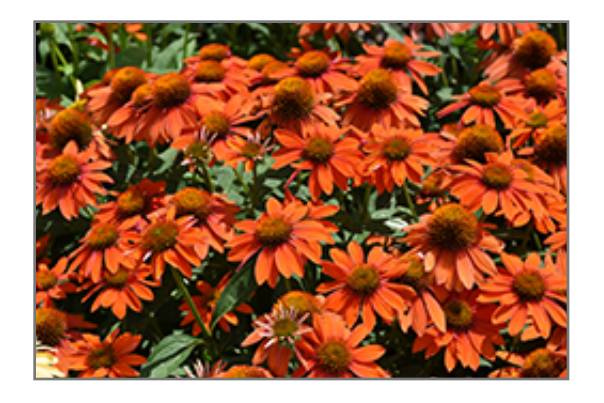
Sombrero Adobe Orange Coneflower flowers

This is a relatively low maintenance plant, and is best cleaned up in early spring before it resumes active growth for the season. It is a good choice for attracting butterflies to your yard, but is not particularly attractive to deer who tend to leave it alone in favor of tastier treats. It has no significant negative characteristics.