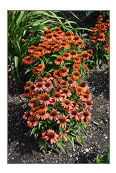
Sombrero Adobe Orange Coneflower in bloom

Sombrero Adobe Orange Coneflower is recommended for the following landscape applications;