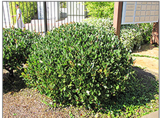
Japanese Mock Orange