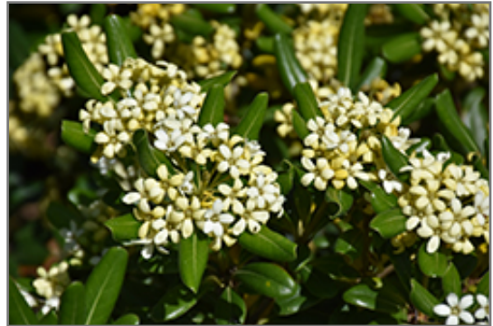
Japanese Mock Orange flowers

This is a relatively low maintenance shrub, and can be pruned at anytime. It has no significant negative characteristics.