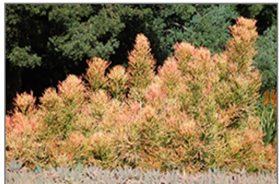
Sticks On Fire Red Pencil Tree