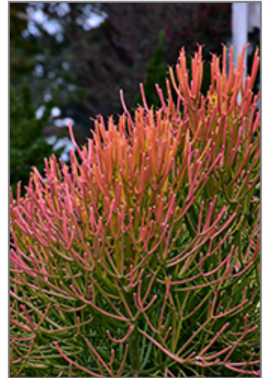
Sticks On Fire Red Pencil Tree foliage

Sticks On Fire Red Pencil Tree is recommended for the following landscape applications;