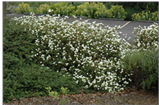
White Rockrose in bloom