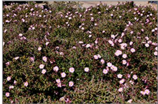
Pink Rockrose in bloom