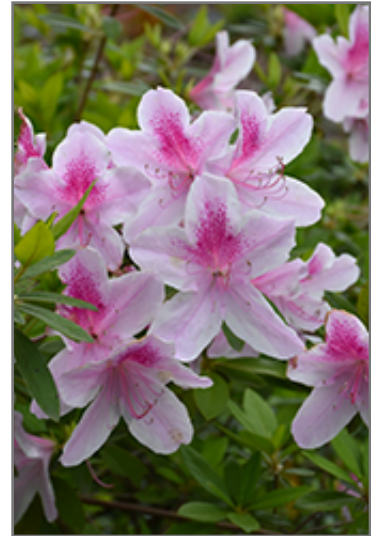
George Lindley Taber Azalea flowers

George Lindley Taber Azalea is recommended for the following landscape applications;