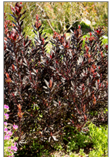
Ebony Conebush