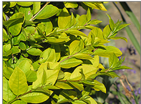
Golden Privet foliage