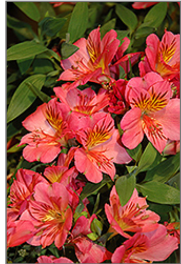
Colorita Eliane Alstroemeria flowers

Colorita Eliane Alstroemeria is recommended for the following landscape applications;