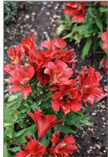
Colorita Kate Alstroemeria flowers