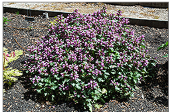
Beacon Silver Spotted Dead Nettle in bloom