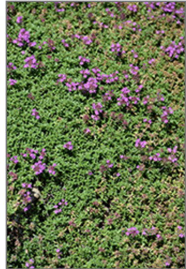
Creeping Thyme in bloom

Creeping Thyme is recommended for the following landscape applications;