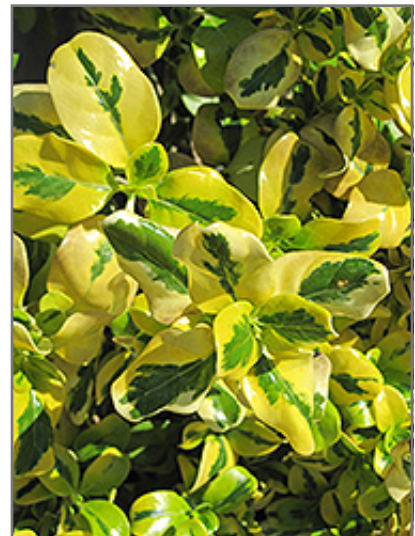
Taupata Gold Mirror Bush foliage