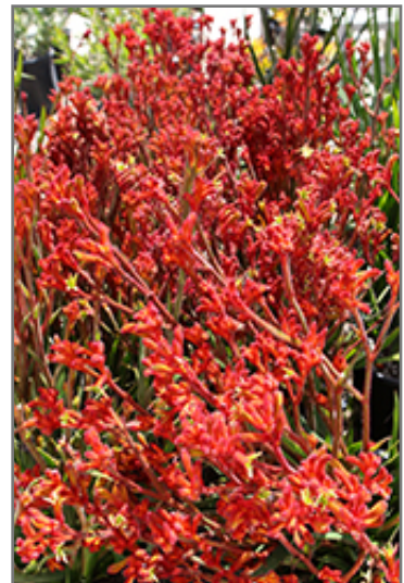
Bush Tango Kangaroo Paw flowers