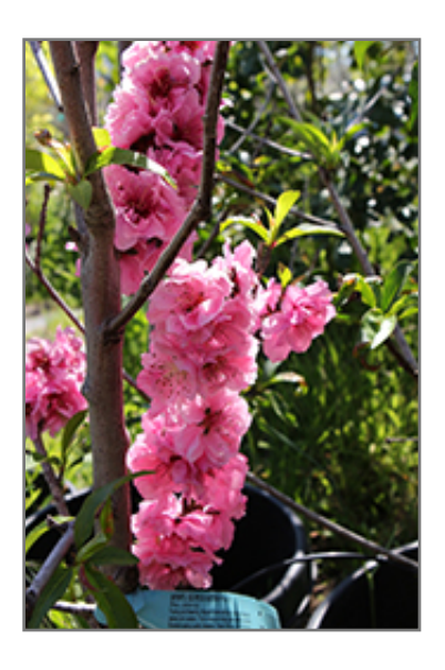
Donut Peach flowers

Donut Peach is smothered in stunning clusters of fragrant shell pink flowers along the branches in early spring, which emerge from distinctive pink flower buds before the leaves. It has dark green deciduous foliage. The narrow leaves turn yellow in fall. The fruits are showy gold drupes with a crimson blush, which are carried in abundance from early to mid summer. The fruit can be messy if allowed to drop on the lawn or walkways, and may require occasional clean-up.