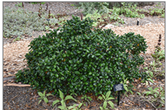
Leatherleaf Coffeeberry