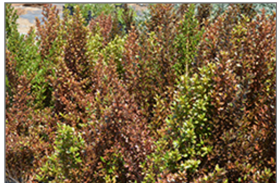
Evening Glow Mirror Bush