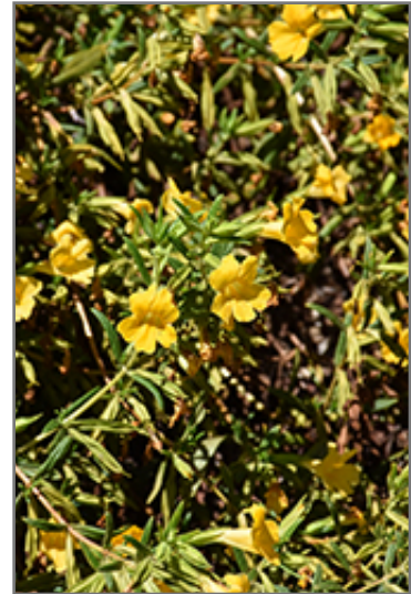
Bush Monkey Flower flowers

Bush Monkey Flower makes a fine choice for the outdoor landscape, but it is also well-suited for use in outdoor pots and containers. Because of its spreading habit of growth, it is ideally suited for use as a 'spiller' in the 'spiller-thriller-filler' container combination; plant it near the edges where it can spill gracefully over the pot. It is even sizeable enough that it can be grown alone in a suitable container. Note that when grown in a container, it may not perform exactly as indicated on the tag - this is to be expected. Also note that when growing plants in outdoor containers and baskets, they may require more frequent waterings than they would in the yard or garden.