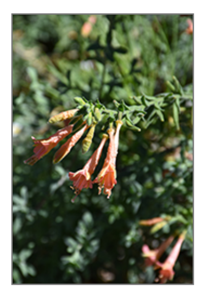
Marin Pink California Fuchsia flowers

Seaside 1177 San Pablo Ave Seaside, CA 93955 831-393-0400