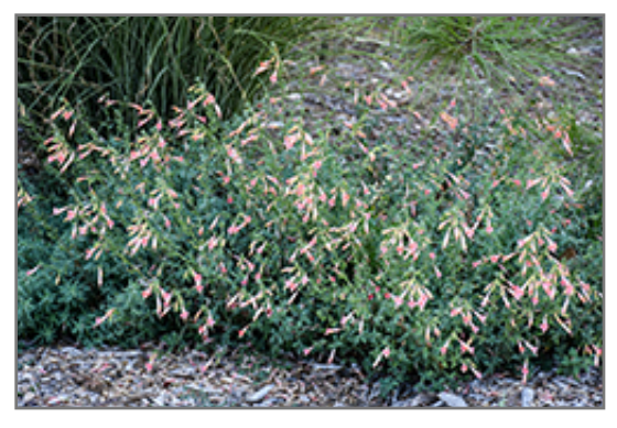
Marin Pink California Fuchsia in bloom

This is a relatively low maintenance plant, and is best cut back to the ground in late winter before active growth resumes. It is a good choice for attracting butterflies and hummingbirds to your yard, but is not particularly attractive to deer who tend to leave it alone in favor of tastier treats. It has no significant negative characteristics.