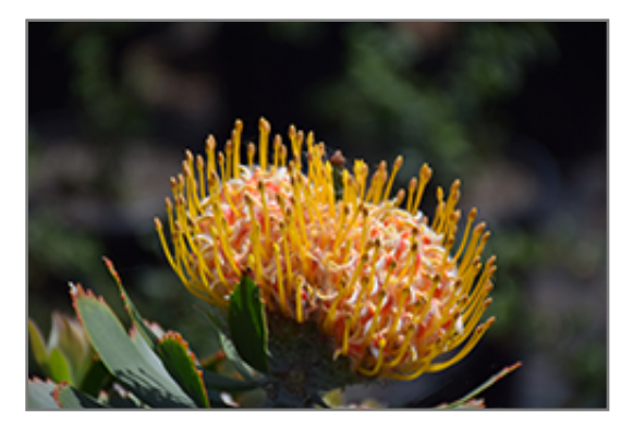
Veldfire Pincushion flowers