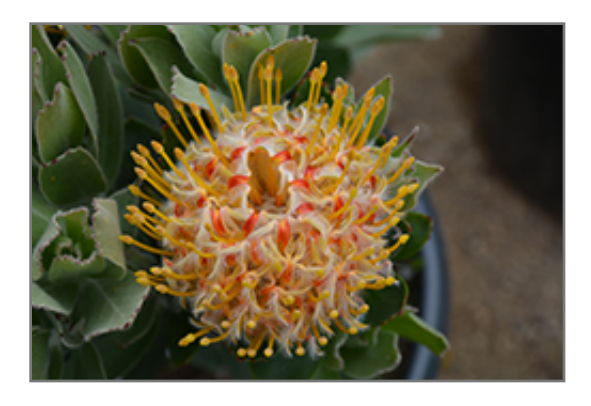
Veldfire Pincushion flowers

Veldfire Pincushion is recommended for the following landscape applications;