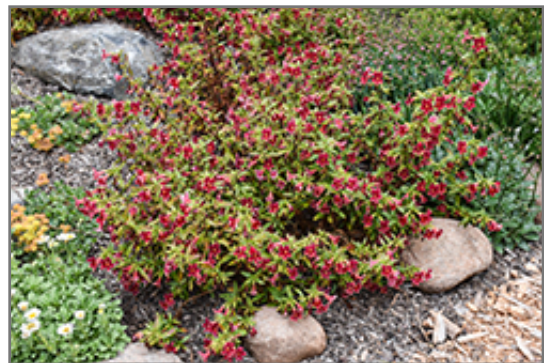
Jelly Bean Dark Pink Monkeyflower in bloom