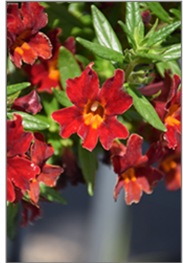
Mai Tai Red Monkeyflower flowers

Mai Tai Red Monkeyflower is recommended for the following landscape applications;