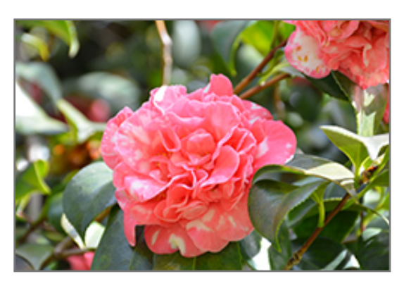
Cleopatra Camellia flowers