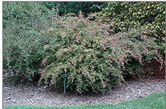
Edward Goucher Abelia in bloom