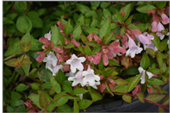
Edward Goucher Abelia flowers

This shrub will require occasional maintenance and upkeep, and should only be pruned after flowering to avoid removing any of the current season's flowers. It is a good choice for attracting birds, bees and butterflies to your yard, but is not particularly attractive to deer who tend to leave it alone in favor of tastier treats. It has no significant negative characteristics.