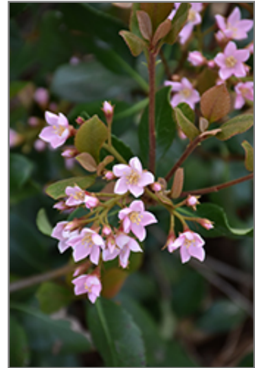
Pink Lady Indian Hawthorn flowers

Pink Lady Indian Hawthorn is recommended for the following landscape applications;