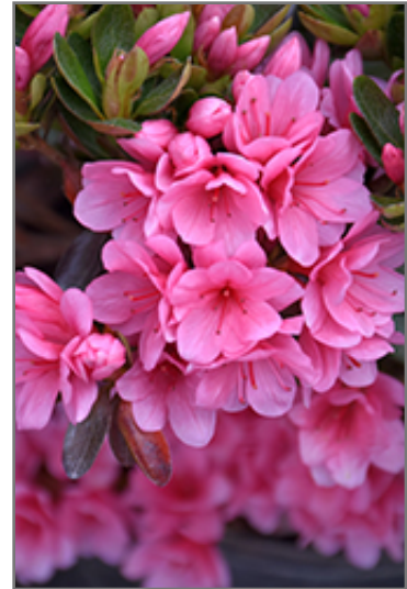
Coral Bells Azalea flowers