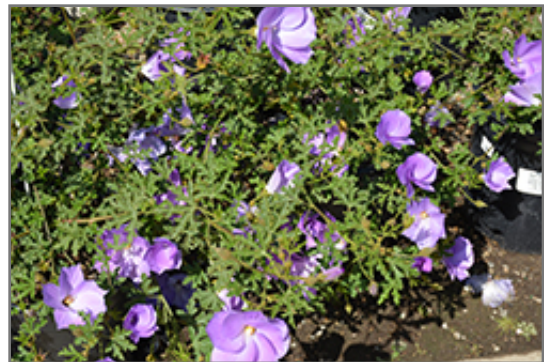
Monterey Bay Lilac Hibiscus in bloom