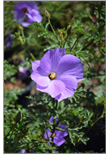
Monterey Bay Lilac Hibiscus flowers

Monterey Bay Lilac Hibiscus is recommended for the following landscape applications;