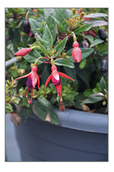
Angel Earrings Dainty Fuchsia flowers