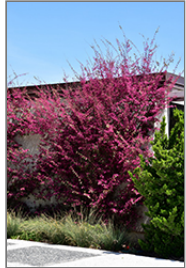
Red-Flowered Chinese Fringeflower in bloom

This shrub does best in full sun to partial shade. It prefers to grow in average to moist conditions, and shouldn't be allowed to dry out. It is particular about its soil conditions, with a strong preference for rich, acidic soils. It is somewhat tolerant of urban pollution. Consider applying a thick mulch around the root zone in winter to protect it in exposed locations or colder microclimates. This is a selected variety of a species not originally from North America.