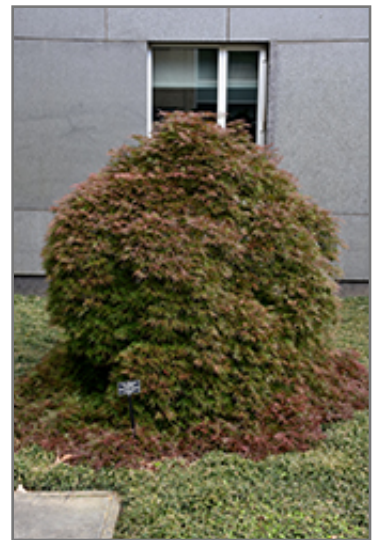
Orangeola Cutleaf Japanese Maple