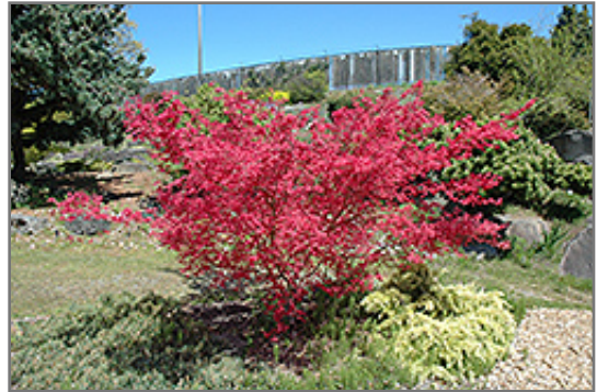
Shindeshojo Japanese Maple in spring

This tree does best in full sun to partial shade. You may want to keep it away from hot, dry locations that receive direct afternoon sun or which get reflected sunlight, such as against the south side of a white wall. It prefers to grow in average to moist conditions, and shouldn't be allowed to dry out. It is not particular as to soil pH, but grows best in rich soils. It is somewhat tolerant of urban pollution, and will benefit from being planted in a relatively sheltered location. Consider applying a thick mulch around the root zone in winter to protect it in exposed locations or colder microclimates. This is a selected variety of a species not originally from North America.