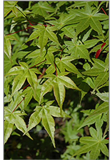
Shindeshojo Japanese Maple foliage

Shindeshojo Japanese Maple is recommended for the following landscape applications;