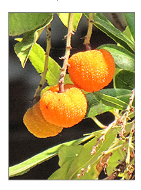
Marina Strawberry Tree fruit