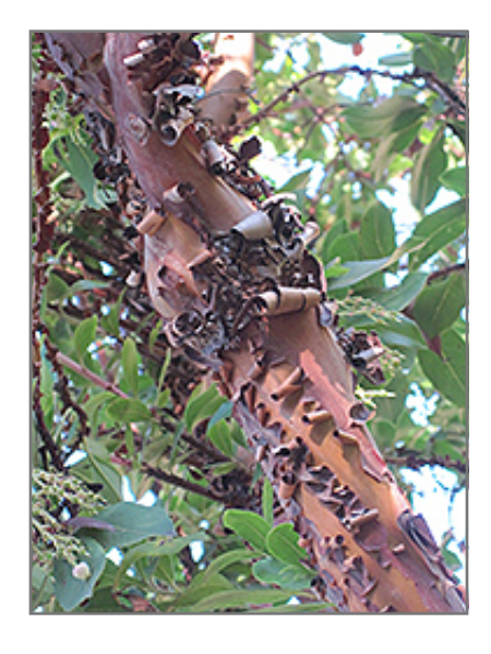
Marina Strawberry Tree bark

This tree should only be grown in full sunlight. It is very adaptable to both dry and moist growing conditions, but will not tolerate any standing water. It is considered to be drought-tolerant, and thus makes an ideal choice for xeriscaping or the moisture-conserving landscape. It is not particular as to soil type or pH. It is somewhat tolerant of urban pollution. This particular variety is an interspecific hybrid.